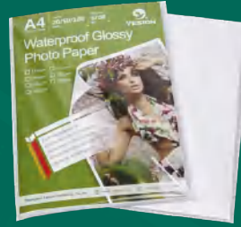
Color sheet +opp bag Material: 128gsm coated paper