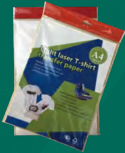
Color pearl film of OPP bag Material: 128gsm coated paper