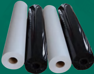
Moister-Barrier opp Bag white or black