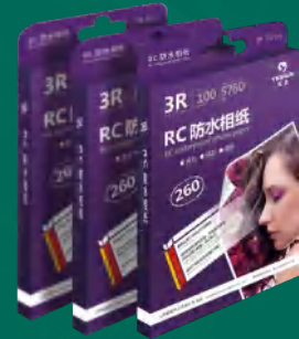
Color box Material:350gsm white/grey