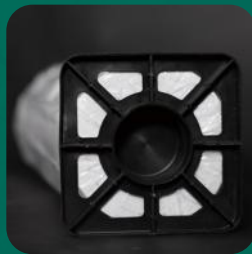
Plug white or black