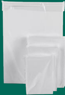
Opp bag Thickness:5um