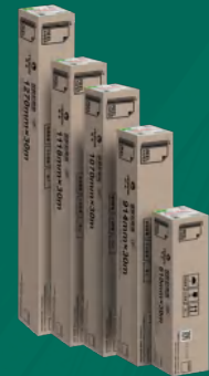
Inner box Three corrugated board